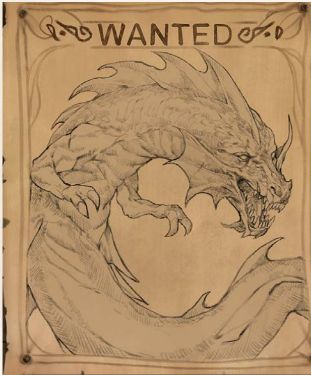
The Whitefang Wurm